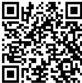
FAFSA Entrance Counseling QR Code