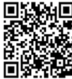
ICAN Scholarship Database

Scheduling an Appointment with an ICAN Student Success Advisor: https://www.icansucceed.org/about-ican/ican-locations