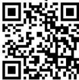
U.S. Department of Defense QR Code